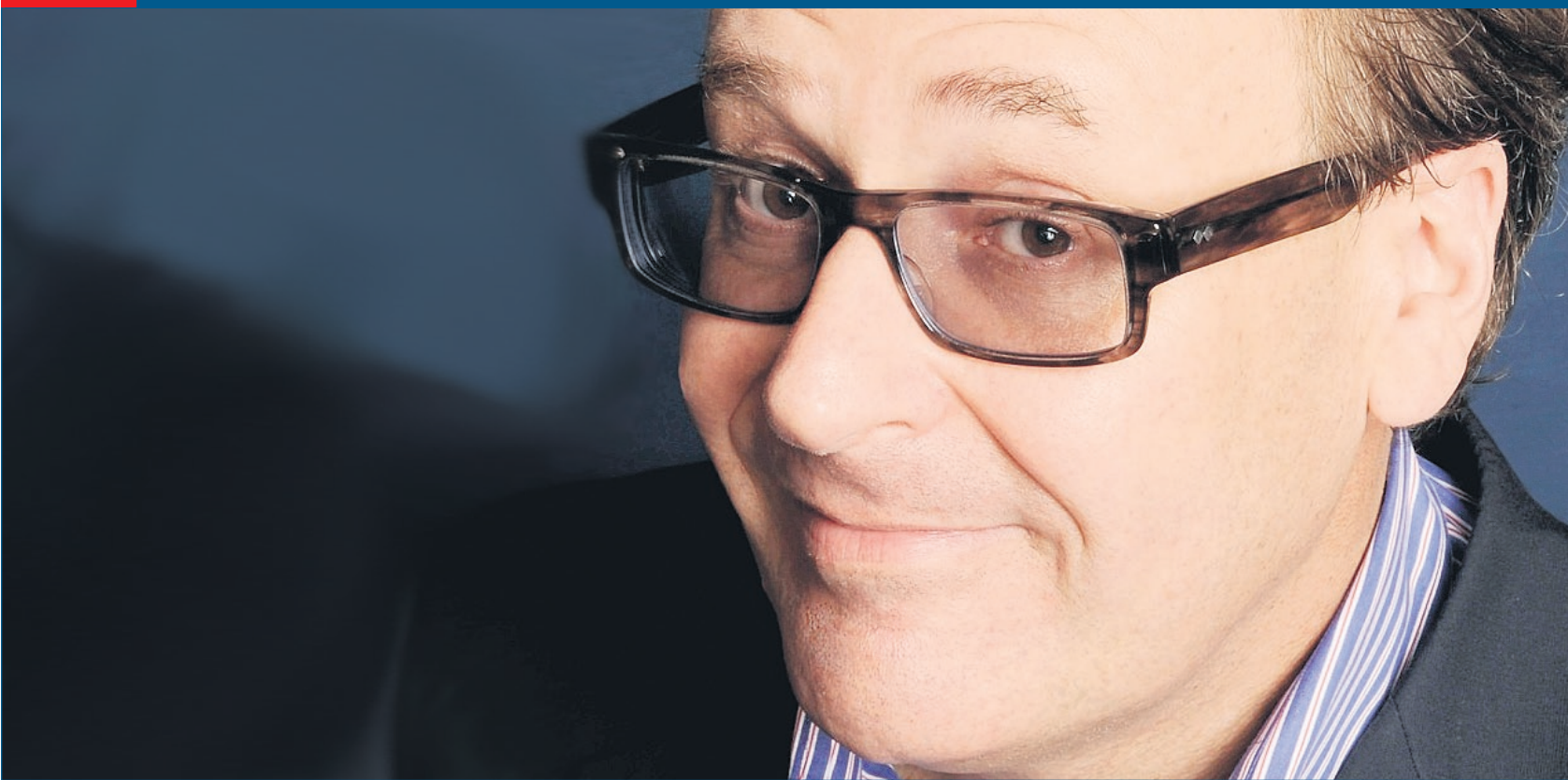
Comedian Greg Proops is appearing at the Nut Hut with his Smartest Man In The World podcast and at the Vodafone Comedy Festival on July 27

COMEDY: IMPROVISER, COMEDIAN, PODCAST GENIUS RETURNS TO DUBLIN STAGE